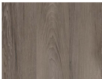
009 Frost Chestnut