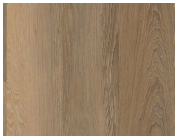
002 New Chestnut