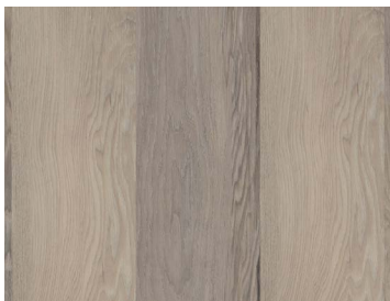
001 Soft Chestnut