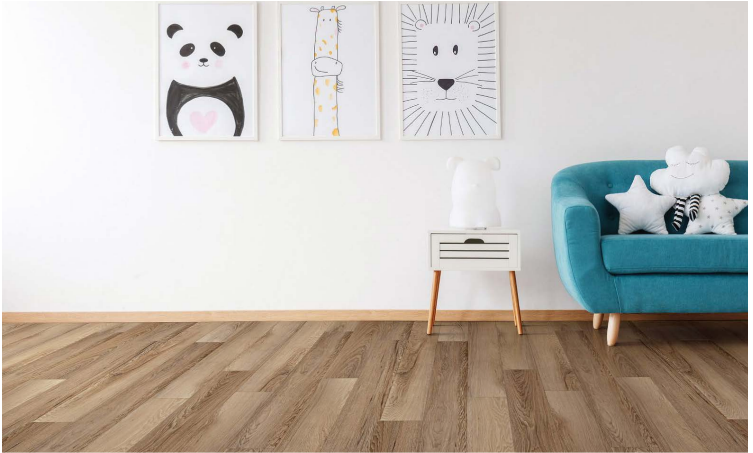
003 Boss Chestnut