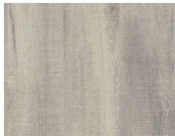
004 Light Oak