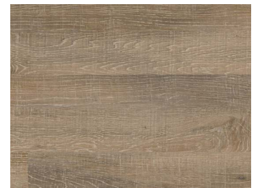
005 Beach Oak