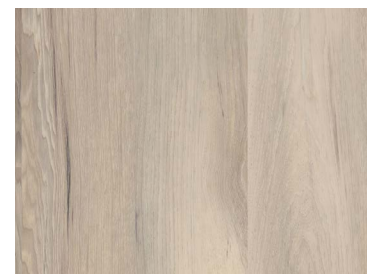
012 Snowy Chestnut