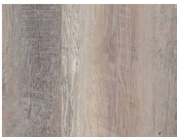
008 Casper Oak