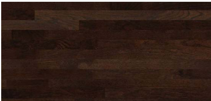
Coffee Bean Oak