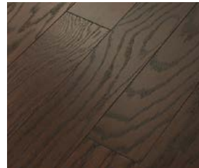
938 Coffee Bean