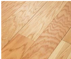
135 Rustic Natural