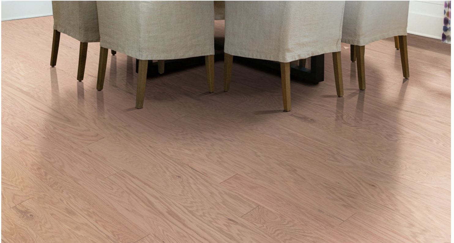
1102 Biscuit Lg