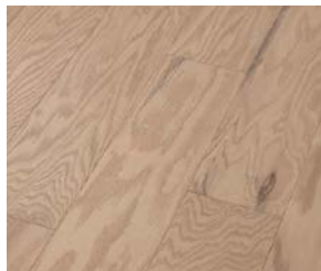
1102 Biscuit Lg