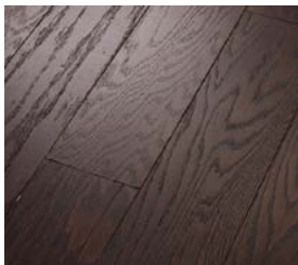
938 Coffee Bean