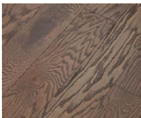
7091 Kona Lg