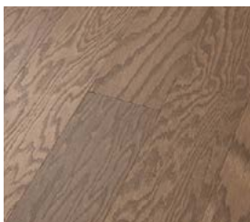
7087 Flax Seed Lg