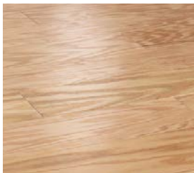
135 Rustic Natural