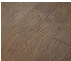
7080 Stepping Stone