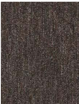
IDEAL A725 (Not available in 13oz)