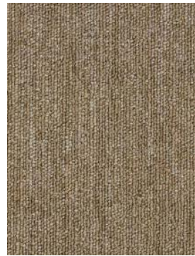
IDEAL M215 (Not available in 13oz)