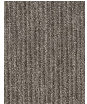
IDEAL B720 (Not available in 13oz)