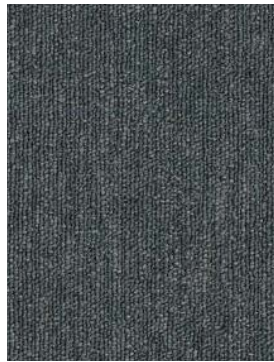
IDEAL A410 (Not available in 13oz)