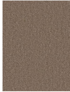
IDEAL A230 (Not available in 13oz)