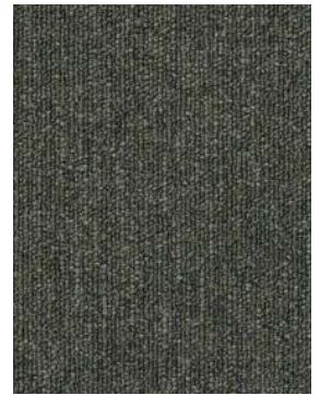
IDEAL S300 (Not available in 13oz)