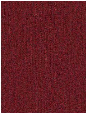
IDEAL T830 (Not available in 13oz)