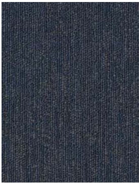
IDEAL V415 (Not available in 13oz)