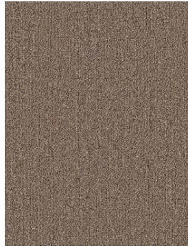
IDEAL E730 (Not available in 13oz)