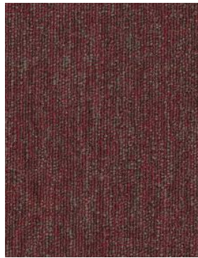
IDEAL G800 (Not available in 13oz)