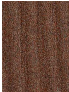
IDEAL S600 (Not available in 13oz)