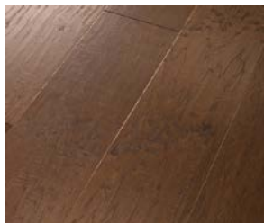
879 Warm Sunset