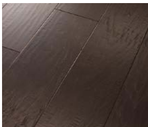
941 Weathered Saddle