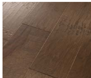
2000 Pacific Crest