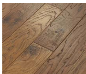
2000 Pacific Crest