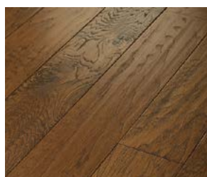
879 Warm Sunset