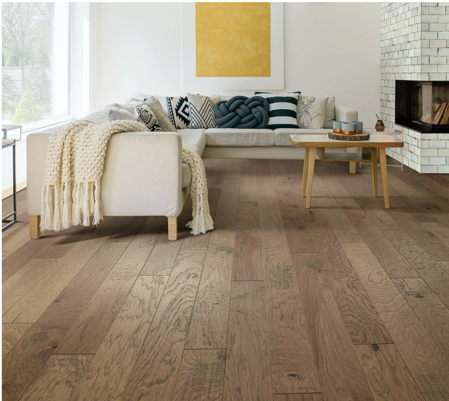
7071 Cassia Bark

Trim Pieces length: 78" (*Overlap Reducer and Overlap Stairnose are designed for floating installations only. These items are non-stocking - but are available through a quick-ship program. Delivery should take approximately 2 to 3 weeks.)