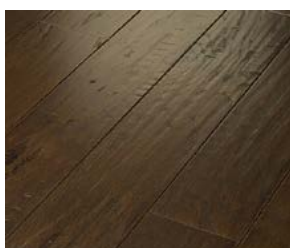
941 Weathered Saddle