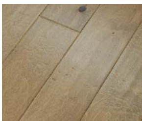
1023 Crescent Beach