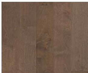
17051 Low Tide