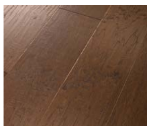
879 Warm Sunset