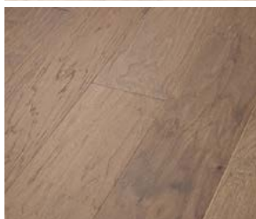
7071 Cassia Bark